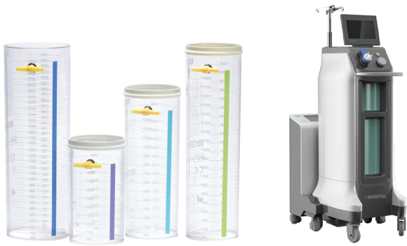
iReceptal® Coming Soon!