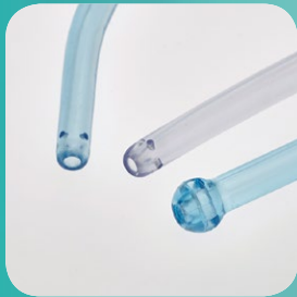
Bulbous and Beveled