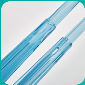
Vented and Non Vented

Kits are available with a variety of suction yankauer devices