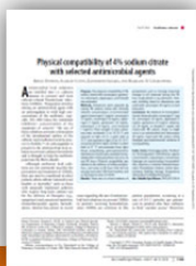
Table 4 | Studies examining the stability and compatibility of Sodium Citrate locking solutions and antimicrobial solutions