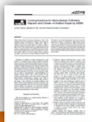
Table 1 Studies examining the Benefits of Sodium Citrate 4% Locking solutions for HD Catheters