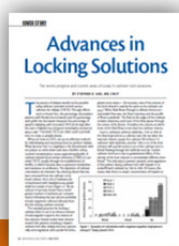
Table 1 | Studies examining the Benefits of Sodium Citrate 4% Locking solutions for HD Catheters